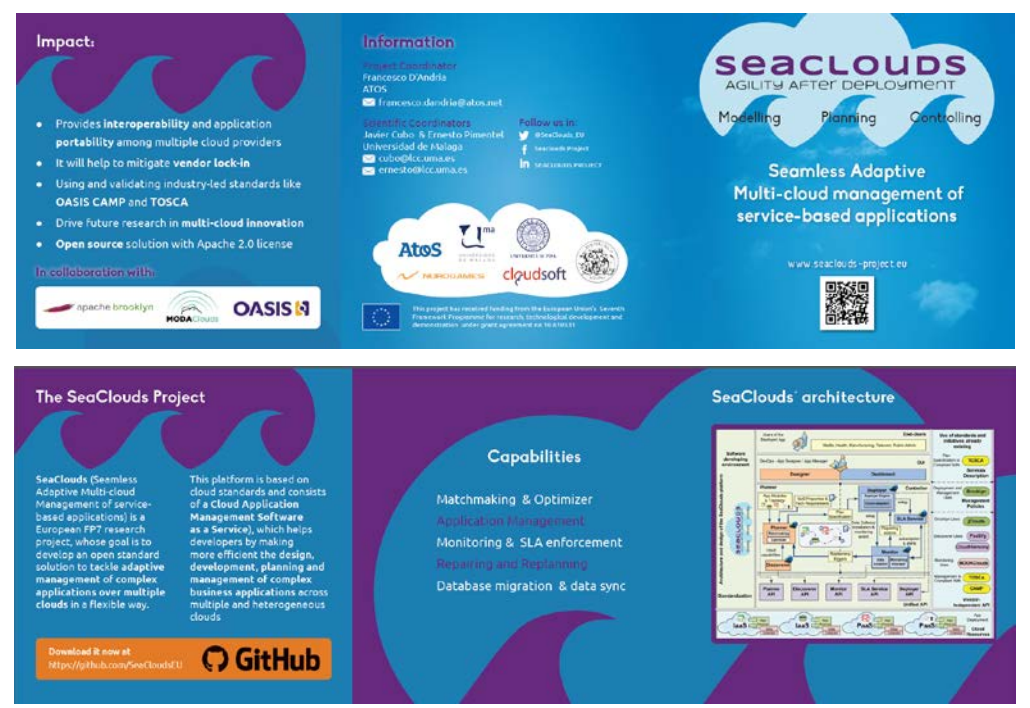
Figure 6 Project flyer (front and back)

Another flyer/leaflet was also created in June 2015 (Figure 8). This small but dynamic format was used to promote SeaClouds during the events and conferences attended.