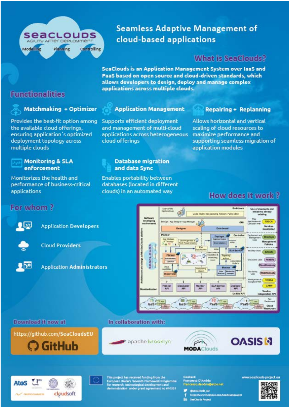
Figure 5 Project poster: archiecture overview

A second poster has been created in June 2015 to provide an overview of the architecture and the main functionalities of the project (Figure 7). This poster has been used in the different events and meetings where SeaClouds project was presented.