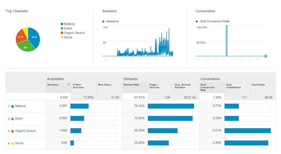
Figure 2 Analysis of the visitors

Deepening a bit more into the analysis of the visitors, Figure 2 shows the distribution of different sources used to reach the project's website. The main source is the referrals (almost 40% of the visits), followed by direct access (with 30%) and organic search (almost 24%). The last of the list is the social media, with less than a 8% of the total.