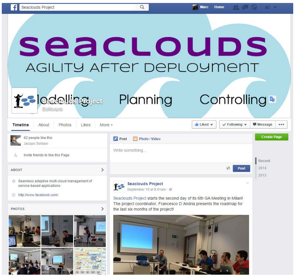
Figure 4 Screenshot of the facebook page of the project

Social media constitute a free and very fast way to communicate with others on just a mouse click. The importance they are achieving in the last years, turn them into a reliable way to connect and stay updated about the most recent developments on a specific industry. Therefore, SeaClouds will reinforce its social media strategy, trying to foster relationships and collaborations with other professionals and companies of the cloud environment.